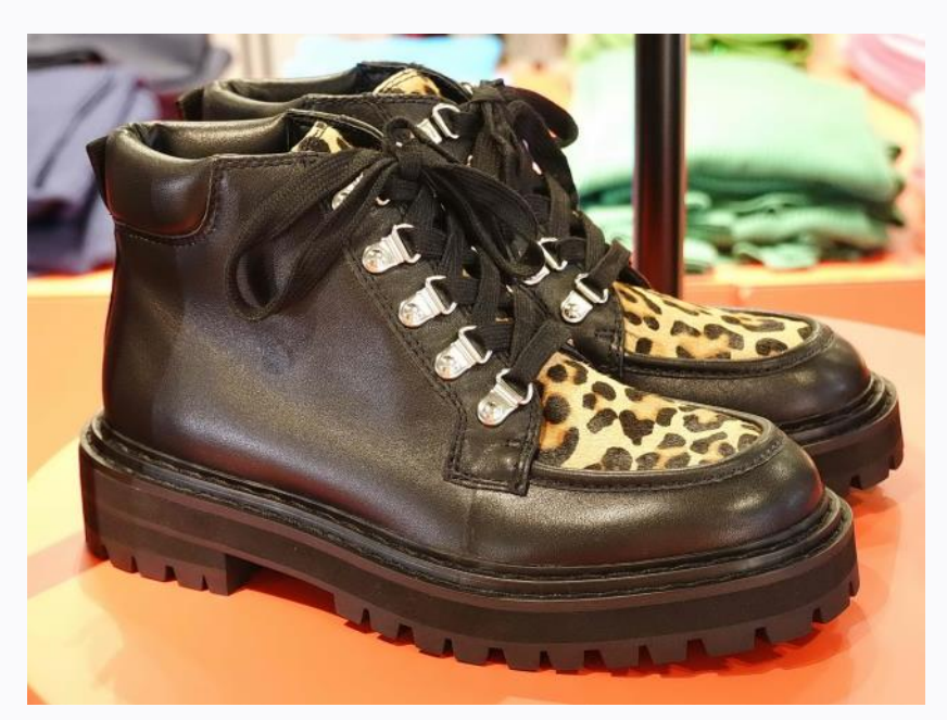
MAX & CO