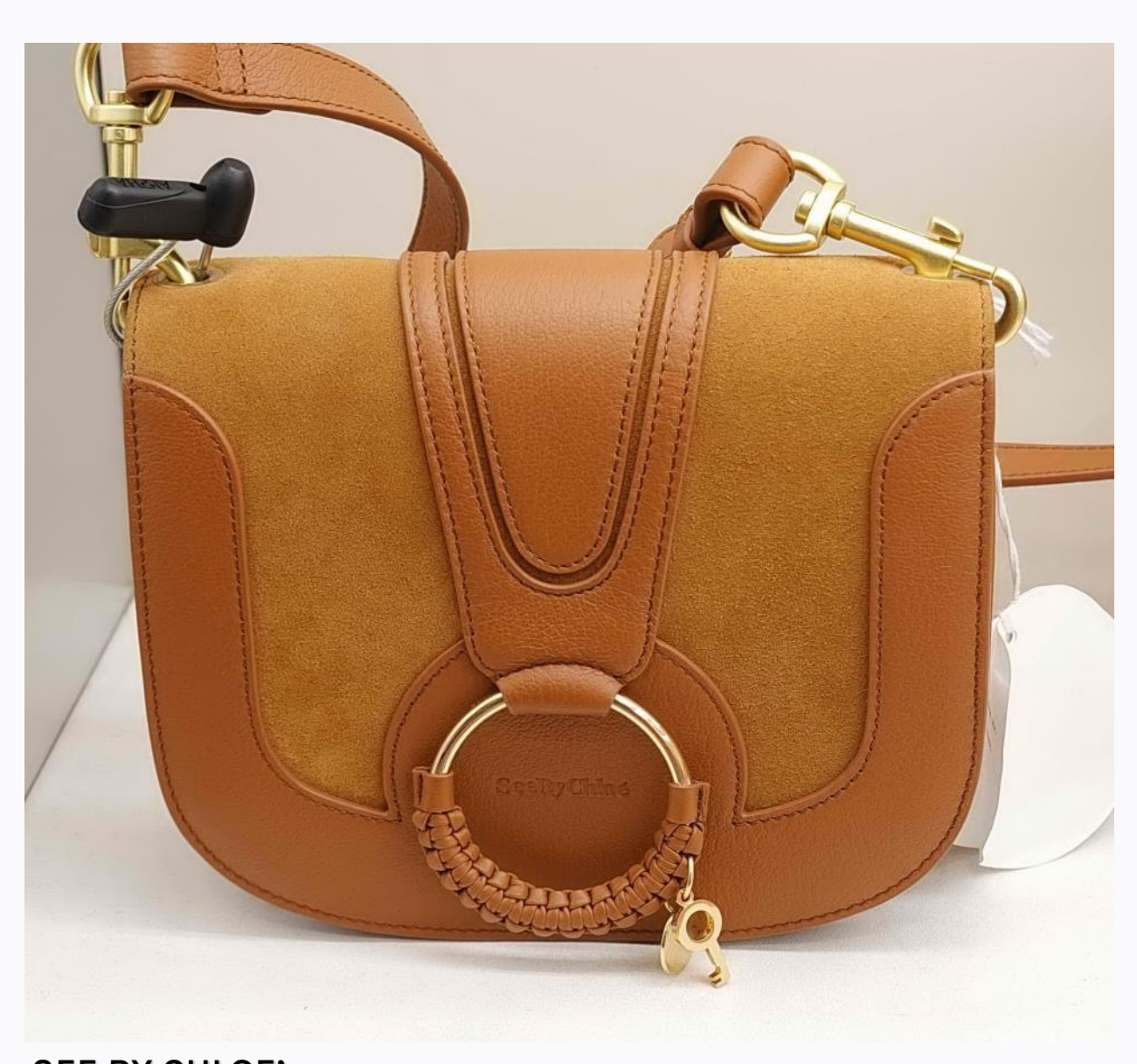
SEE BY CHLOE'