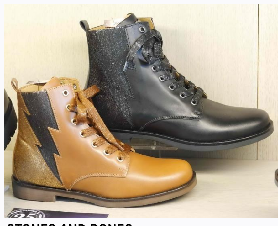
STONES AND BONES