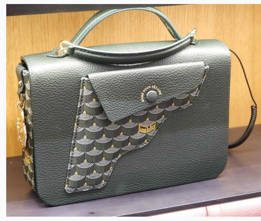
FAURE LE PAGE