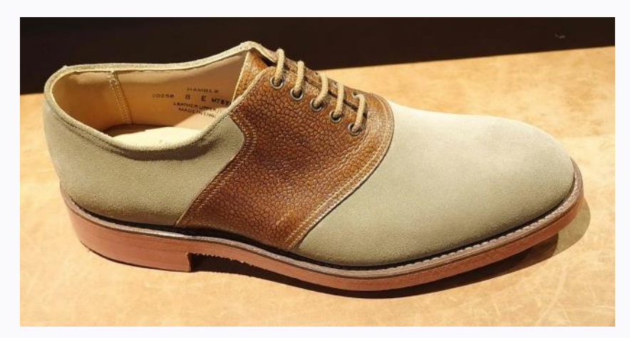
CROCKETT & JONES