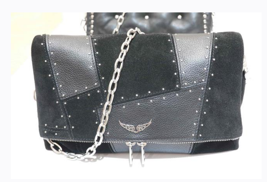
ZADIG & VOLTAIRE