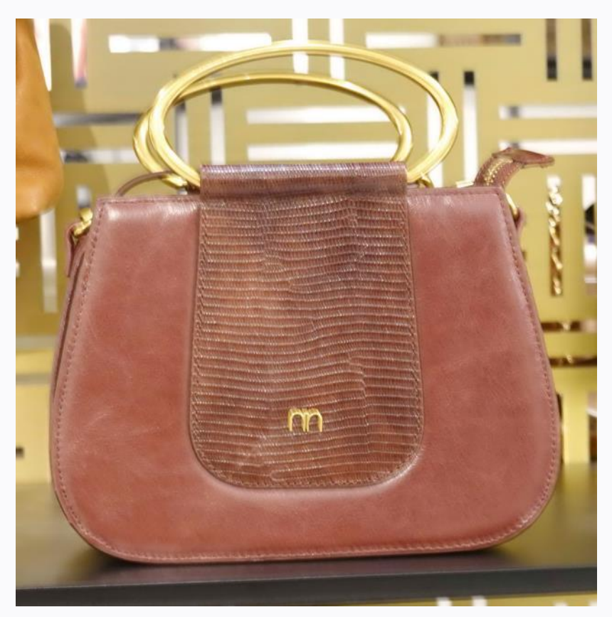
NAT & NIN