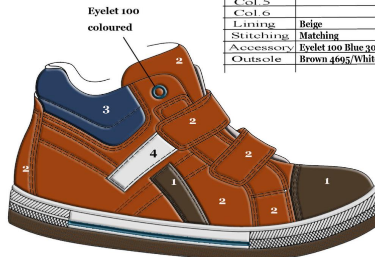
Outsole LIMBO-31 (MALASPINA)